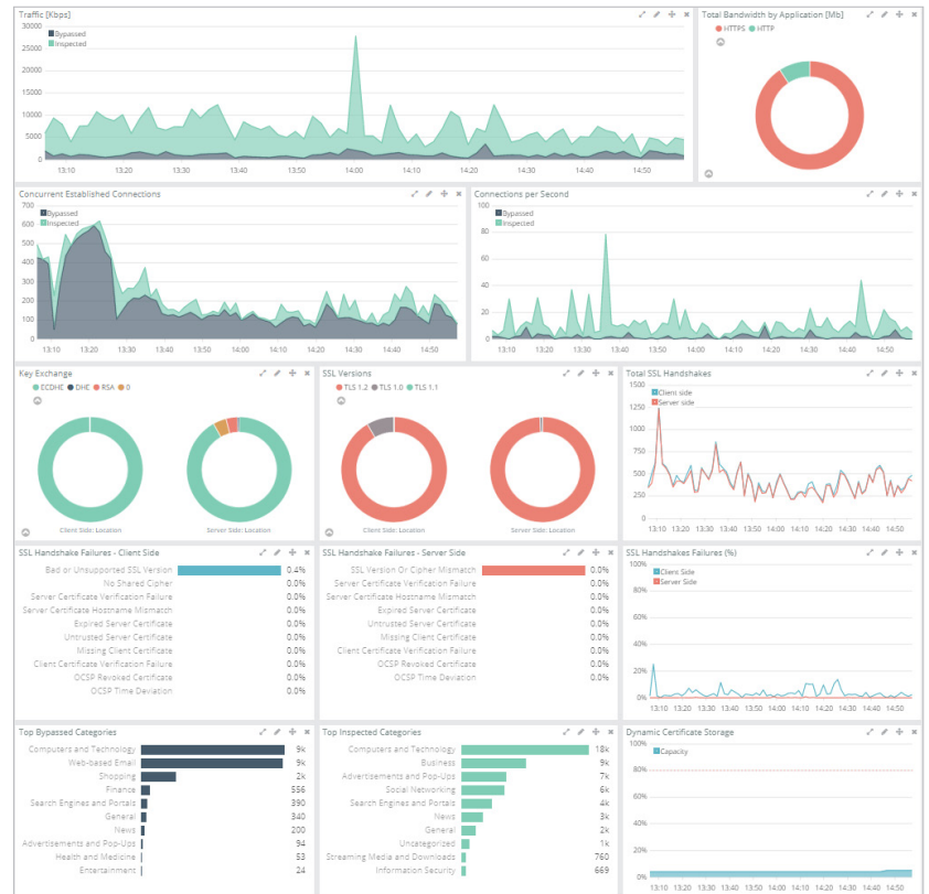
Figure 3 - SSL Inspection Dashboard